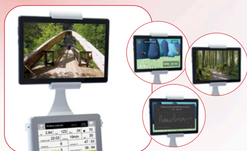
KINEVIA ENTERTAINMENT SYSTEM