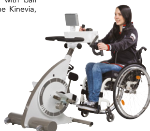
Kinetec Kinevia Duo™

Both Kinevia Duo™ (arms + leg) and Kinevia™ (legs only) come with a number of innovative specifications. From the tool-free adjustment coming as standard or the premium wheels with ball bearing easing transport to the 5-year warranty extension on all mechanical parts our units offer a premium user experience at all levels.