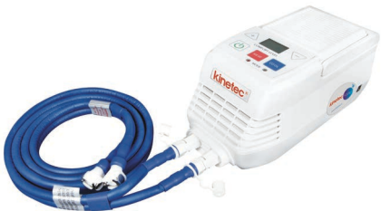
KINETEC KOOLER™ UNIT 4665009518

Kinetec Kooler™ is a powerful and practical pain relieving device that uses thermoelectric technology to provide heating and cooling therapy where and when you need it, without the use of ice. Our technology satisfies a clear clinical need for safe, effective, and targeted localized treatment with precise temperature management.