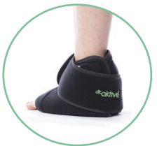
ANKLE SUPPORT DA030102