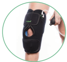
KNEE SUPPORT DA030101