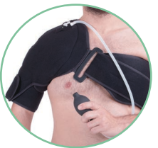
SHOULDER SUPPORT DA030103

Not shown: WRIST SUPPORT DA030105 KNEE SUPPORT WITH HINGE DA030106