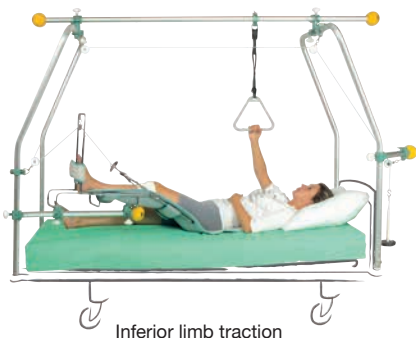
Inferior limb traction

Below are some examples of traction or suspension.