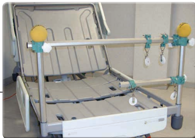
Bed ArjoHuntleigh - Enterprise 5000/8000/9000 Kinetec® partial assembling • MP E8000 4655003702