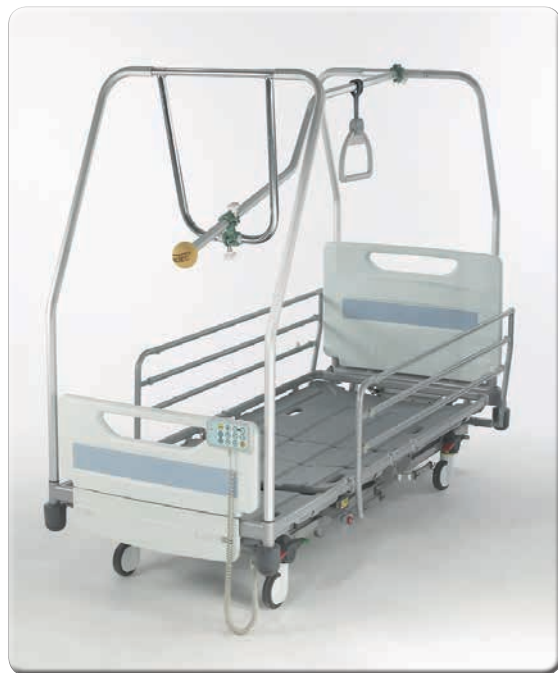
Bed ArjoHuntleigh - Enterprise 5000/8000/9000 Complete Kinetec® set • T24 4655003661

As well as the traction frames, there are a wide range of accessories available to adapt to the needs of each patient so please do not hesitate to request more information.